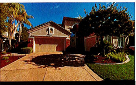
5659 PORTRUSH CT, 95138 4 BD | 2 BA | 2833 SF | SOLD $2,505,000

This year was incredibly profitable for many homeowners, even during a vastly shifting market with rising interest rates. We assisted homeowners in selling their homes, many of which sold for more than the asking price. Below are a few of our listings. You may be surprised at how much your home could sell for, don't hesitate to contact us to learn about your current home value.