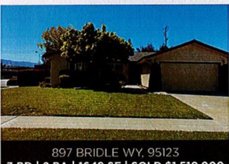
3 BD | 2 BA | 1649 SF | SOLD $1,510,000