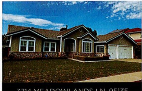
3714 MEADOWLANDS LN, 95135 4 BD | 3 BA | 2540 SF | SOLD $2,560,000