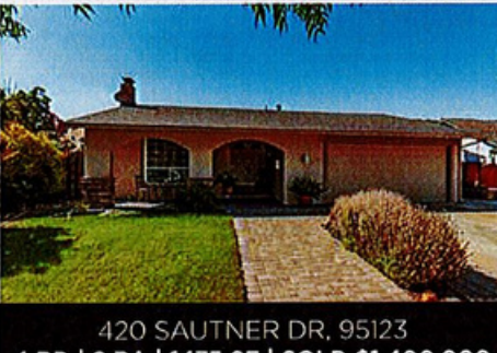
4 BD | 2 BA | 1475 SF | SOLD $1,400,000